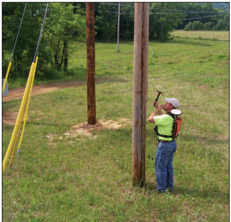
GIS Landmark employee tagging a pole on the GMEC system.

For the past several months, GIS Landmark has been taking an inventory of the electric distribution system serving your homes. To date GIS has completed several areas and will continue into 2010. GIS vehicles will have Guernsey-Muskingum Electric Cooperative magnetic signs. Employees will be wearing bright reflective vests and an orange backpack. The employees of GIS Landmark are contracted to patrol the entire right-of-way, record information, take photos and GPS location readings at each point of the system, including meters.