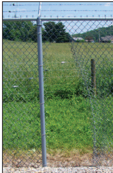
Thieves cut through the substation's fence to steal copper wire.

We have added extra security measures, but we also need your help. If you see any non-cooperative vehicles in or around substations, call the sheriff's department and alert them. We are also offering a $5,000 reward for information leading to the arrest and conviction of the copper thieves from the June 7 incident.